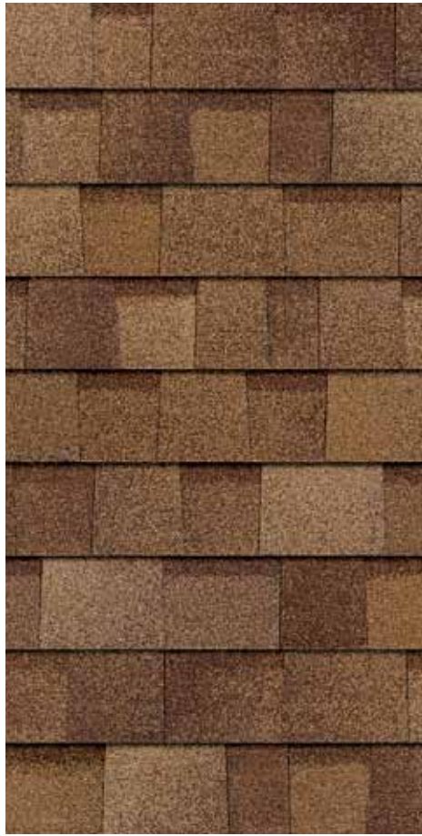
Desert Tan +