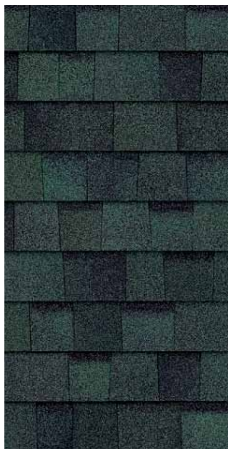
Chateau Green †