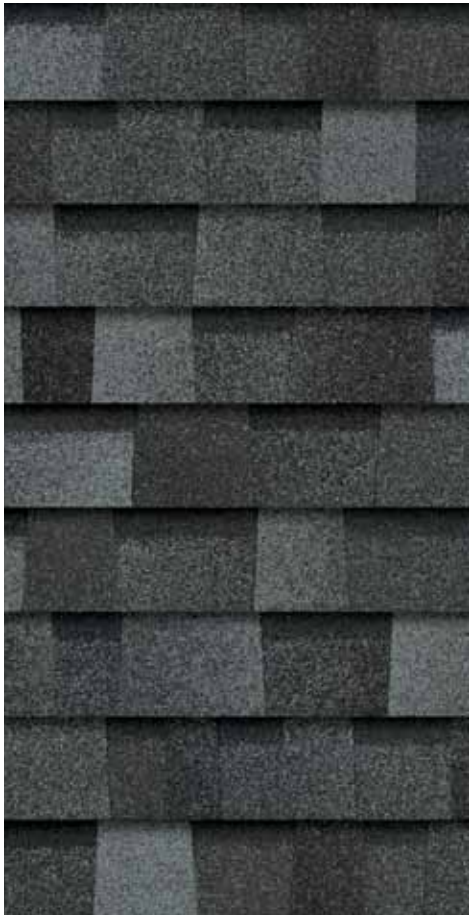
Slatestone Gray † Not available in Regions 1, 2, and 3