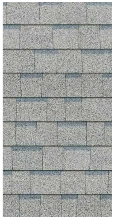
Shasta White +