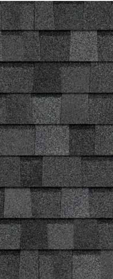
Estate Gray †