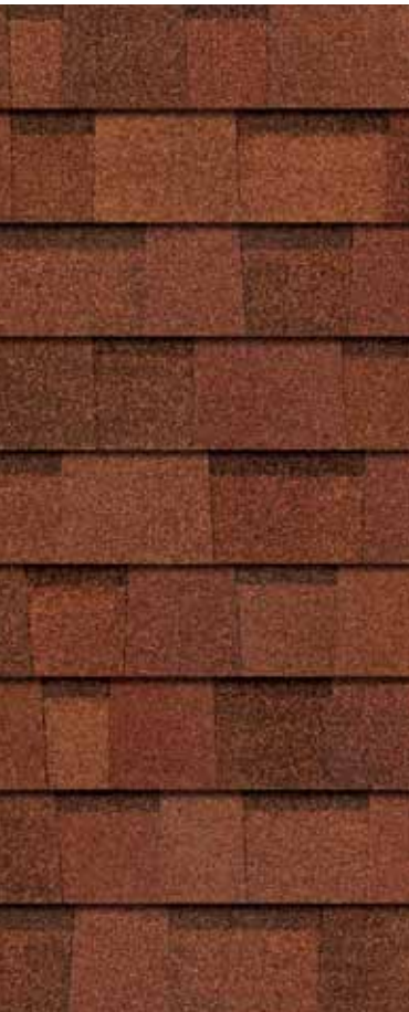
Terra Cotta † Not available in Region 1