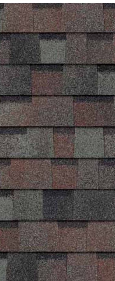
Colonial Slate † Not available in Region 1