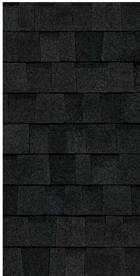
Onyx Black †