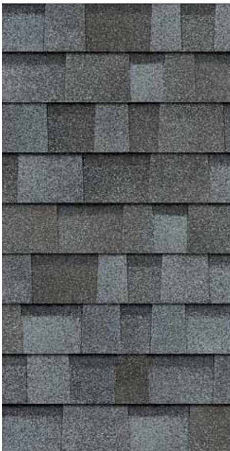
Quarry Gray +