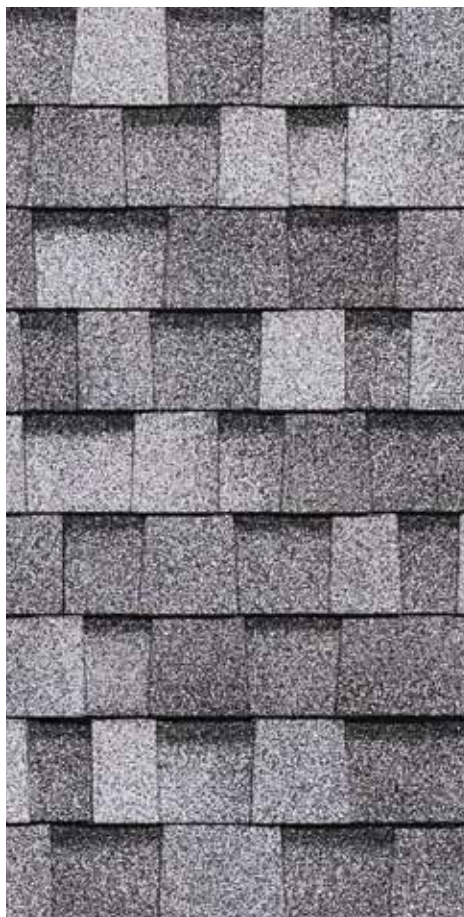
Sierra Gray +