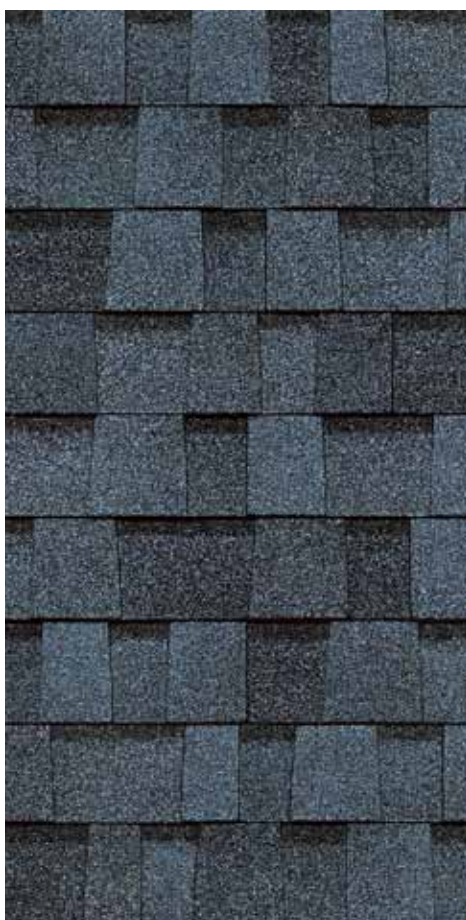
Harbor Blue †