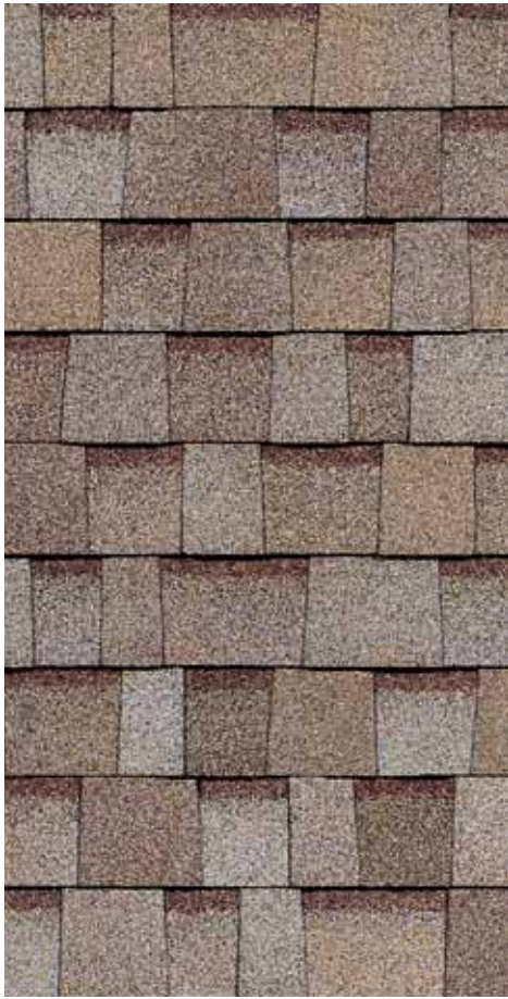
Amber + Not available in Region 1